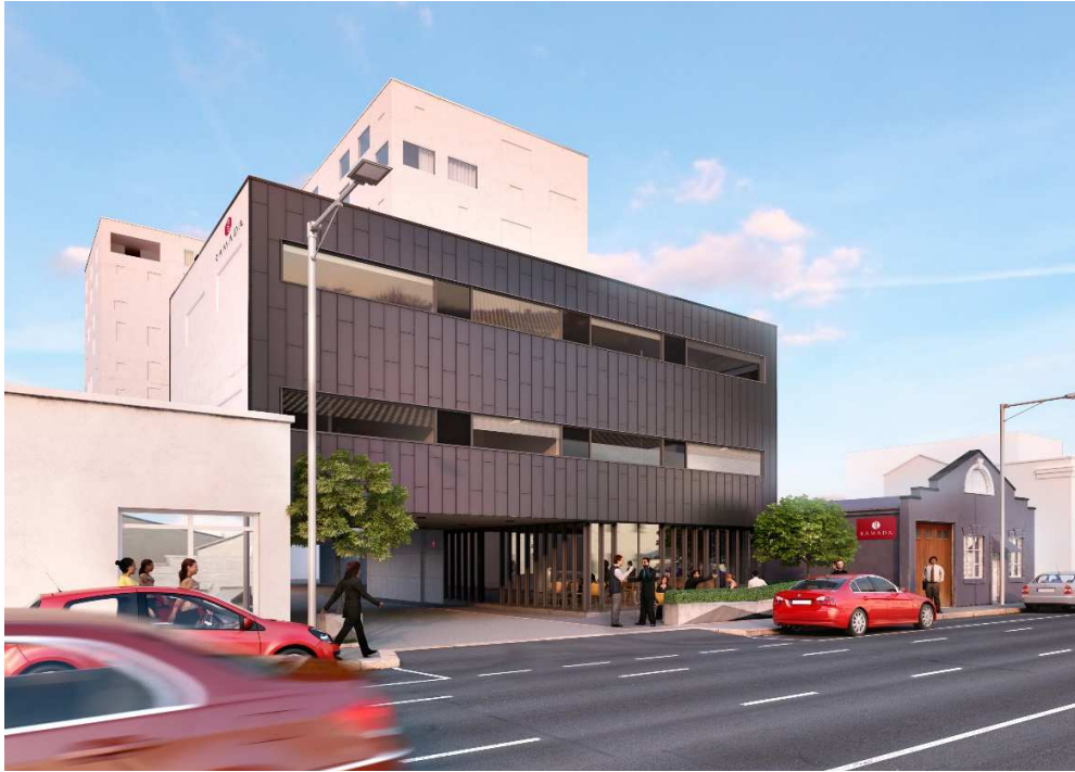
OUR LATEST DEVELOPMENT