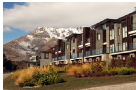
Queenstown, enjoying a surge of international and domestic flights and a tourist boom, topped the charts of New Zealand cities with the highest hotel price rise last year.

Sydney hotel prices fell 4 per cent and Melbourne 2 per cent.