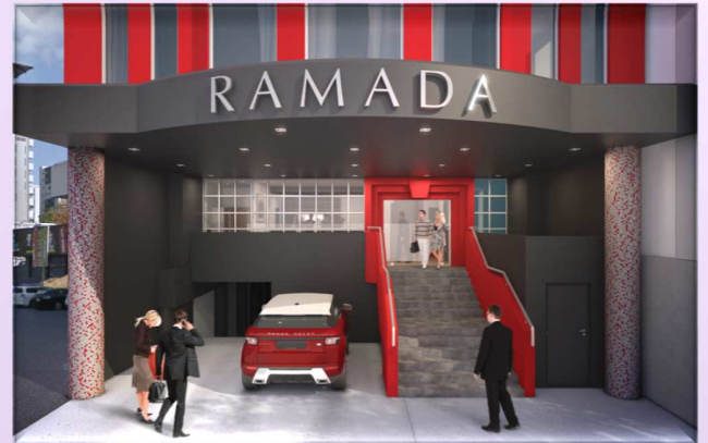
RAMADA ON FEDERAL STREET, AUCKLAND

Construction started on 7 th April at Ramada on Federal Street with building consent being processed and works to be commencing with approval for early fit-outs.