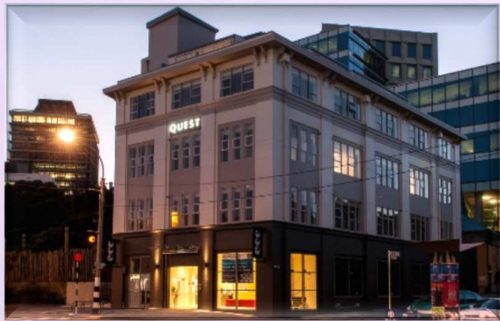
QUEST ON THORNDON

This beauty which was completed in late 2014 is now operational and trading at full capacity. There are 4 units remaining as well as the ECC retail unit now available so be quick to secure an investment opportunity in Wellington that will line your pockets with growth for years to come.