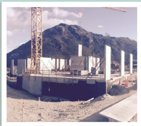
RAMADA SUITES TUAM STREET, CHRISTCHURCH

Ramada Suites in Christchurch is trading well with its contemporary look contributing to the development of the “new” city. Contact us now to be part of this lucrative investment. 29 Units sold 15 Units available Owner entitled to 5 days free use per annum