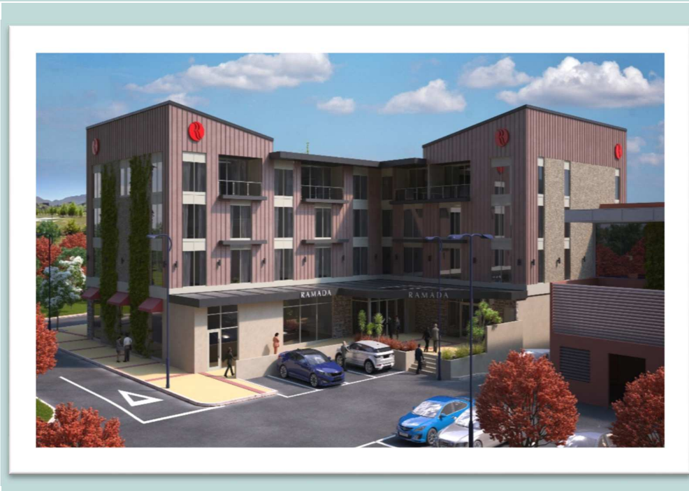
RAMADA SUITES QUEENSTOWN